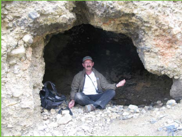
Director Himalaya searching for peace

Namaste and greetings from Kathmandu...Since summer, it has been a very busy time for TMI Himalaya programs. Starting in August, work on the proposed REDD project has intensified and