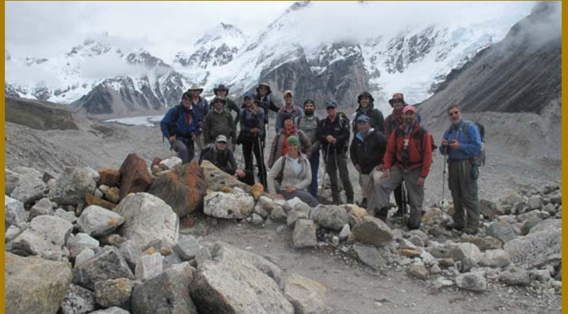
Andean-Himalayan Expedition members at Gorakshep

The Mountain Institute (TMI) hosted the first Andean-Asian Glacial Lake Expedition in the Mount Everest (Khumbu) Region in Sagarmatha National Park and Buffer Zone, Solukhumbu, Nepal from September 4th-22nd, 2011. More than thirty international technical and social scientists participated in the expedition to observe the potentially dangerous glacial lake at the top of the world and the great peaks of