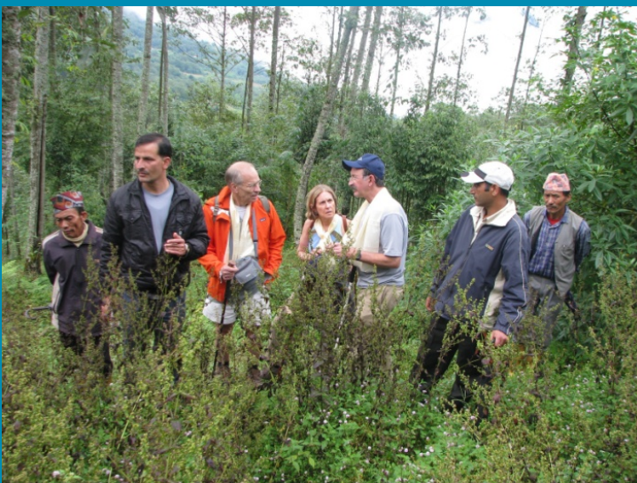
TMI's Trustee making observation at MAPs project

future. This Trustee's field visit took place from 18-23 September 2011 and they were accompanied by TMI's NGO partners.