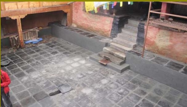
Completion of slade pavement in the courtyard

In November 2011, The Mountain Institute will officially close the Abassador Fund for Cultural Preservation (AFCP) project implementation. Although this project was officially end in end of July, The Mountain Institute was able to extend this project until end of December 2011.