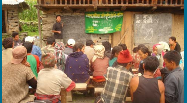
MAPs cultivation training

The Mountain Institute's livelihood support program on MAPs is going very well in marginalized and remotest mountain areas of Dhading and Rasuwa of Central Nepal. The program aims to strengthen livelihoods and conserve natural resources through domestication of wild medicinal and aromatic plants (MAPs). The result of its first year's program has started showing impacts with direct benefits to the local communities. Local people from Tetangche and Gatlang VDC of Rasuwa already have started making income from selling