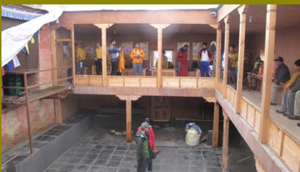
Visitors inside the Pangboche Gomba

At present, an approximately 90% of the total program has been completed. The reason for the request for an extension was due to heavy monsoon in throughout the mountains, there was no flights for two weeks and the trails and bridges have been washed out in some of the sections below Lukla and this has delayed in shipping some of the materials for the gomba restorations. Trails and bridges are necessary where the walking tracks are the only means of travel for both trekking and also shipping for goods including materials.