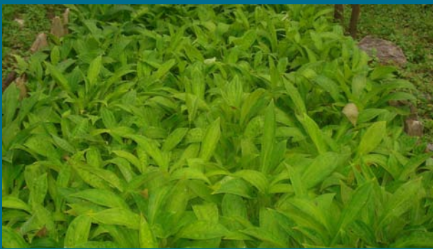
Chiraito cultivation in Lapa, Dhading

seedlings of chiraito, estimated at approximately 500,000 rupees in equivalent to US$ 7,000). Two nurseries of Tipling and Richet of Lapa VDCs are one of the best nurseries among the MAPs nursery program in Nepal, based on the observed maintenance and sapling growth rates. Till now altogether 404 participants have received MAPs cultivation and conservation. 111 participants received MAPs refreshment training to strengthen their skills in MAPs cultivation, marketing and conservation. The 364 trainees have cultivated the MAPs on approximately 41.46 hectare of their private lands so far. The second phase of the MAPs