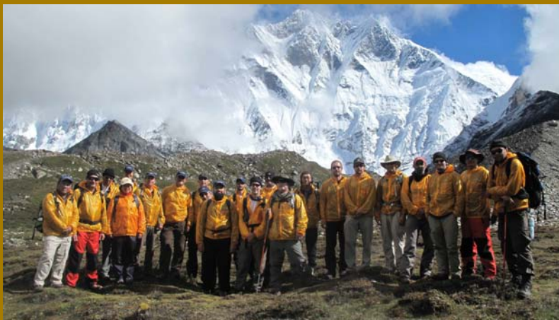
Andean-Himalayan Expedition Members at Imja Base Camp

Himalayas. This is the home of Sagarmatha National Park and Buffer Zone, a World Heritage Site. The expedition hosted physical and social scientists from different regions of the world, including the Andes, Hindu-Kush-Himalaya, Central Asia, Japan, North America and Europe. During the 18 days in the field, both the physical and social scientists conducted formal and informal discussions about climate change, glacial lakes and climate adaptation.