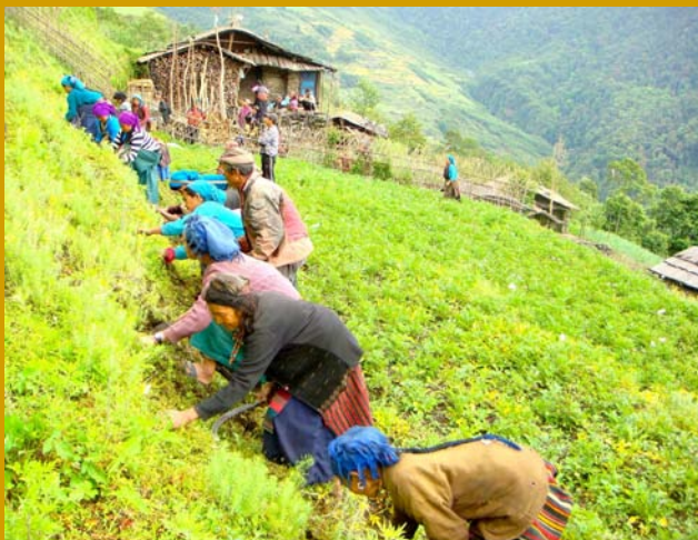
MAPs cultivation field practical

Meidicinal and Aromatic Plants (MAPs) cultivation training: Three MAPs cultivation and conservation training were conducted in Hongong village in Upper Arun Valley. The participants were from different groups including Community Forest Users Group (CFUGs), Women Group (WG), Makalu-Barun National Park and Buffer Zone Users Group (MBNP/BZUG) and local Youth Groups.