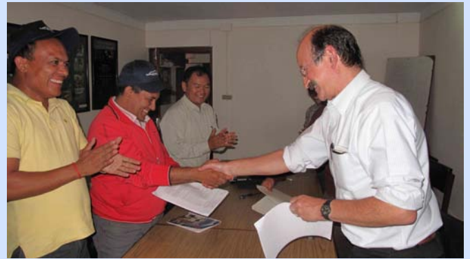
TMI and HCDA signed contract for Food for Work

The Mountain Institute (TMI) and Humla Conservation and Development Association (HCDA), signed contract for the period of nine months starting from October 2011 to June 30th 2012 with the goal to continue implementing “Food for Enterprise” in the Humla district in the Mid-West Nepal. This program will provide food assistance to food deficit and conflict affected population in Nepal as part of WFP’s Protected Relief and Recovery Operation (PRRO).