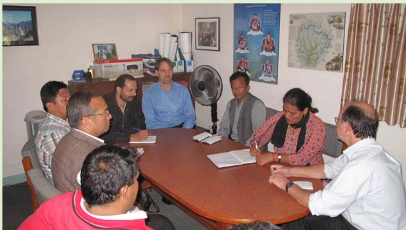
Meeting with FECOFUN about REDD project in the east