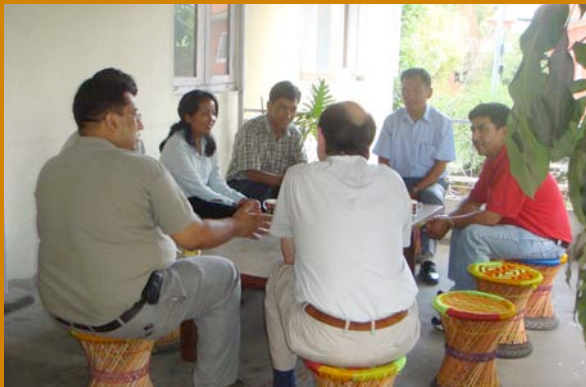
TMI staff discussing on proposal concept

A n o t h e r approach TMI uses is to work extensively through local partner organizations. TMI has helped form and strengthen a number of local non-governmental organizations in the Himalayan Region. The approach of using local partner organizations yields many lasting positive benefits including reducing costs, expanding impacts, enhancing program sustainability and creating local capacity to conduct conservation programs after projects are completed.