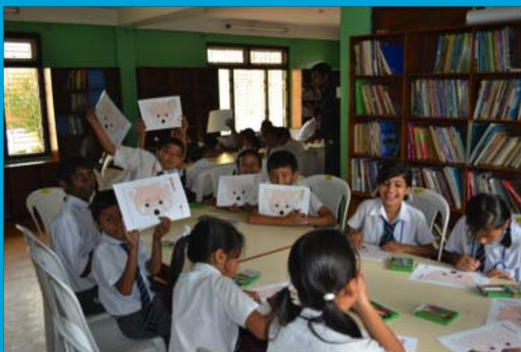
Participating School Children in Kathmandu

Red Panda Network (RPN) commemorated the second international Red Panda Day (IPPD) with the slogan :Save the red panda: promote ecotourism in the Eastern Himalaya” fro the first time in Nepal on September 17, 2011. The day was celebrated in Taplejung and Kathmandu Districts with various activities. A programme was organized by RPN in association with Himali Conservation Forum (HCF) in Taplejung District. The representatives from different organizations including Government Offices (GOs) Non-Governmental Offices (NGOs), Community Based Organization (CBOs) and major political parties of the district took part in the day. Chief District Officer (CDO) Mr. Dev Raj Dhakal inaugurated the programme. concise presentation on the “Red Panda: an introduction on “Importance of Red Panda: an introduction” was delivere